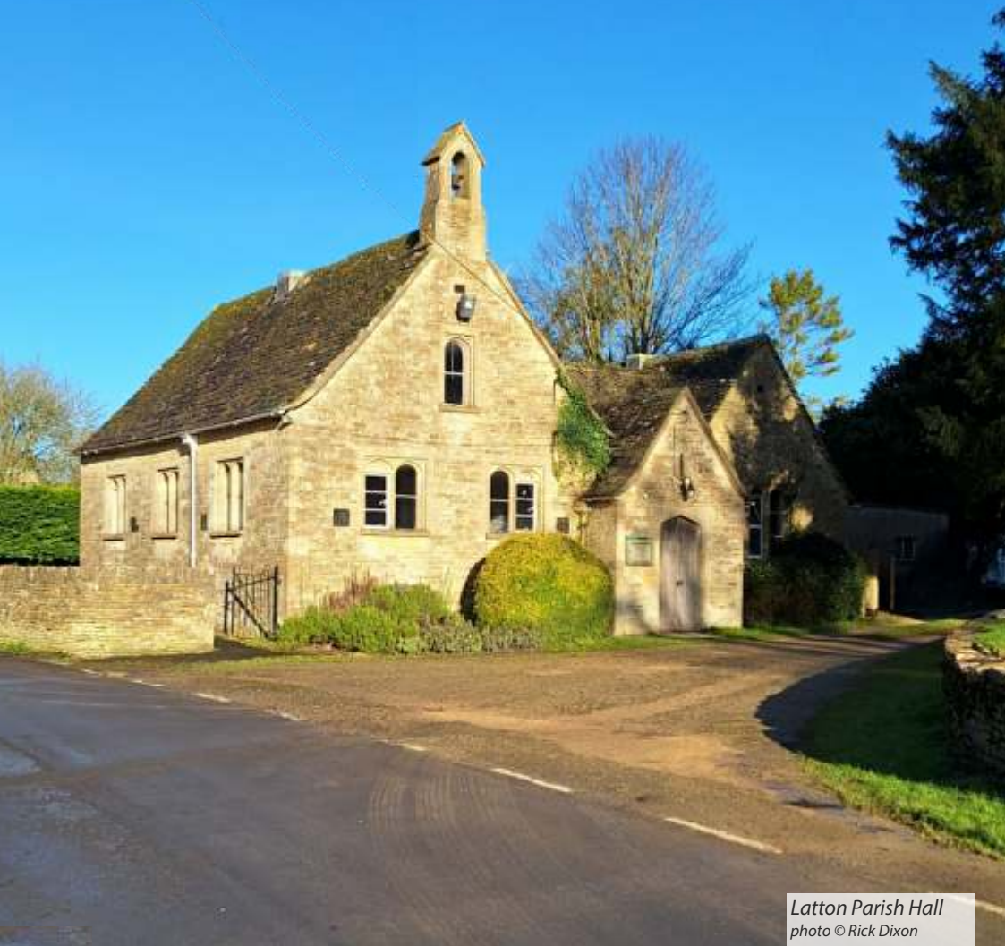
Latton Parish Hall